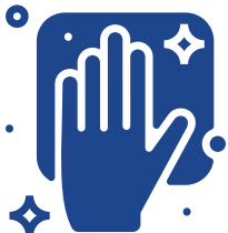
Cleanroom wipes or lint-free cloth