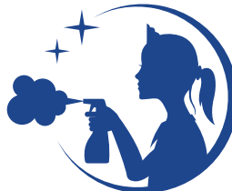
IPA or approved cleaning solution